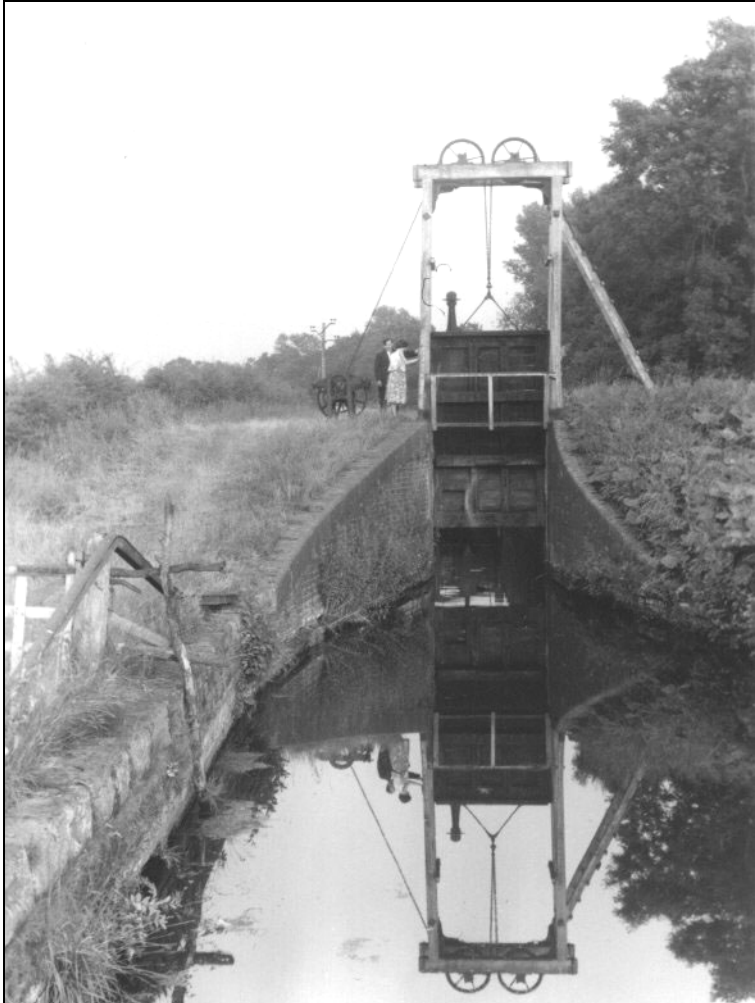
Eyton Lock, No. 10, Shrewsbury Canal