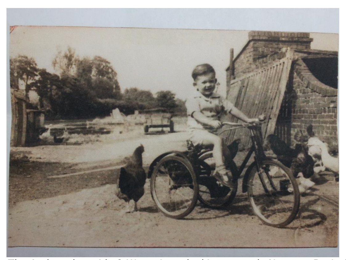
The Author alongside 9 Water Lane looking towards Newport Basin & Wharf c 1950

area has been totally redeveloped. A large black warehouse with which Charles Oakley would have been very familiar has been moved from Water lane and rebuilt at the Blist Hill museum, where it is in use as a carpentry shop.