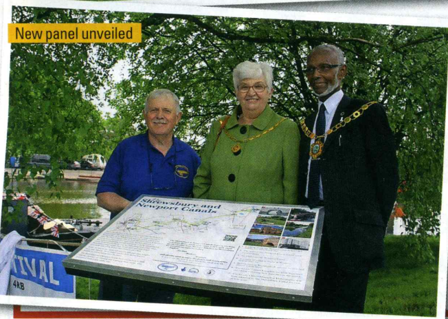
New panel unveiled