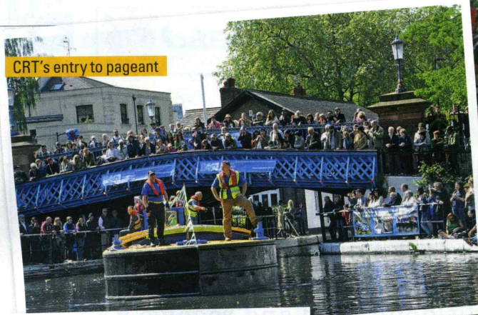
CRT's entry to pageant