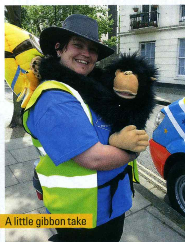
A little gibbon take