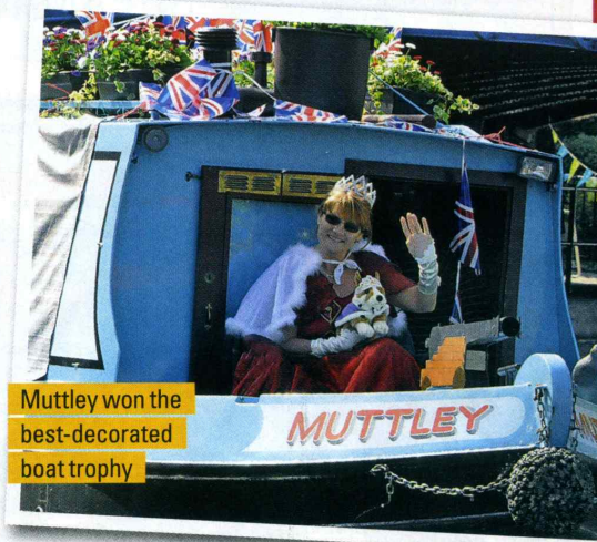
Muttley won the best-decorated boat trophy