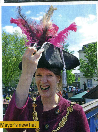
Mayor's new hat