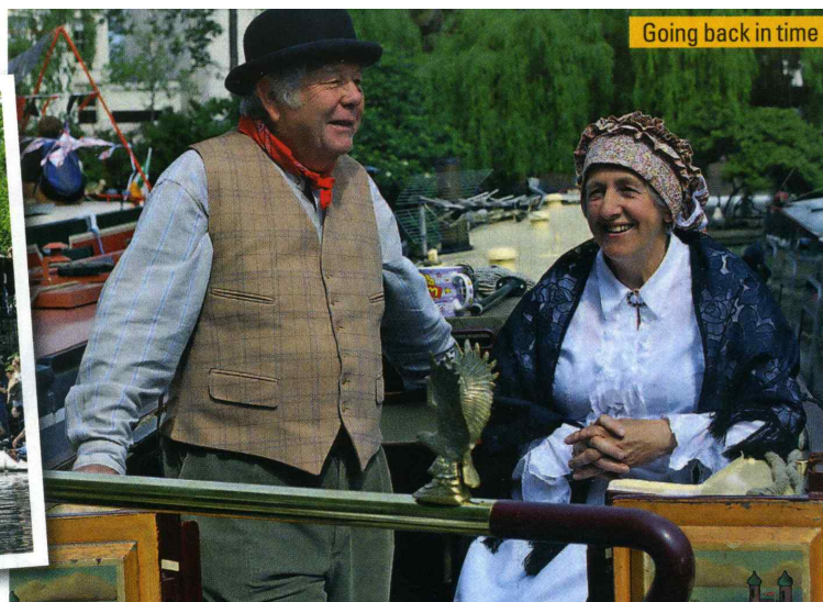
Going back in time